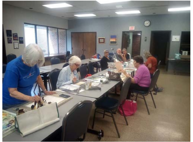
Painters Club Thursdays at Village Hall